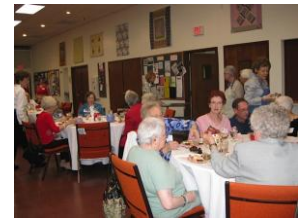
↑ PW members & guests VPC-Green Valley, AZ