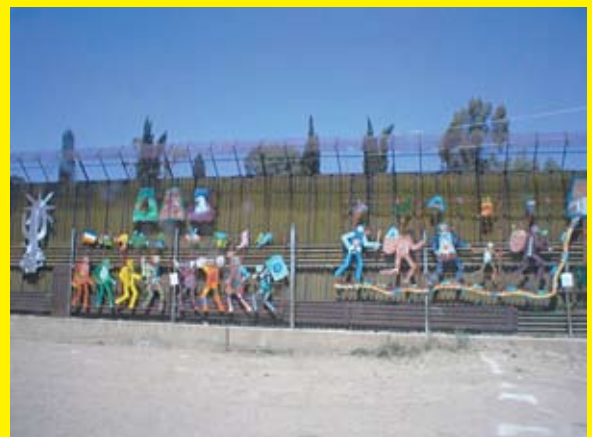
A section of the wall that separates Mexico from the United States. People on the Mexican side have decorated the wall with hopeful figures, minimizing the harshness of the wall.

Ephesians 2:14 – “...for Jesus is our peace, who has made us both one, and has broken down the dividing wall of hostility.”